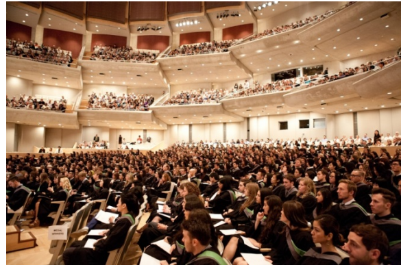
OCADU Convocation at Roy Thomson Hall, Toronto ON

For our first year there were 1,184 qualified OCADU student applicants for our bursary. Slightly more than the several dozen or so I thought might apply.