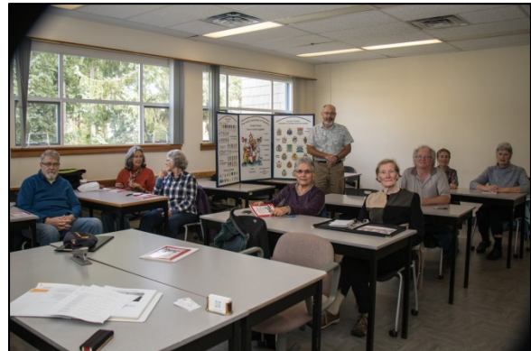
ElderCollege heraldry course at North Island College Courtenay BC, October 2016.

For the autumn of 2016 a four session course was developed and a second campus was added, Campbell River BC as well as Courtenay BC. Over the summer I had time to refresh the subject material and to improve my lesson plans for the classes. And economy of scale applied as I could use the same material in both locations. The courses, run in October and into November, proved very popular. And, similar to the earlier shorter course, the final session had the students designing their arms on sheets of blank shields. They were encouraged to keep working on their